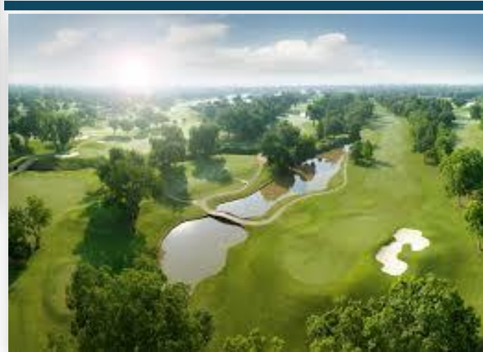
RIVERBEND COUNTRY CLUB