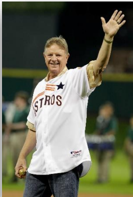
Houston Astros Baseball pitcher, manager, and broadcaster Larry Dierker