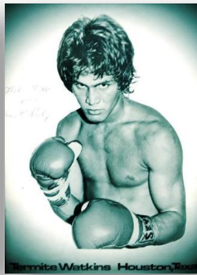
Welterweight World Title Contender Termit Watkins