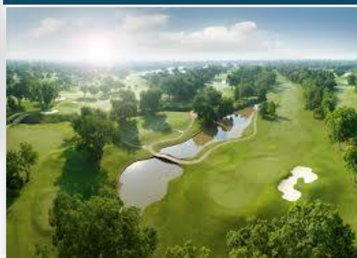
RIVERBEND COUNTRY CLUB