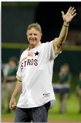
Houston Astros Baseball pitcher, manager, and broadcaster Larry Dierker